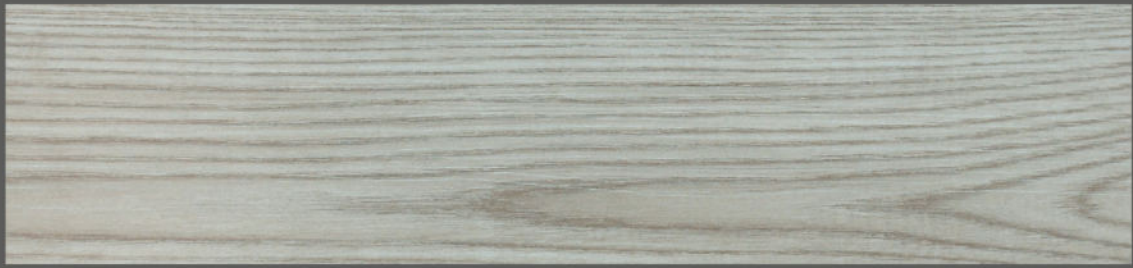
TV 3031 Charleston Teak NEW

Size 152.4mm x 914.4mm 24 pieces/box 3.34sqm