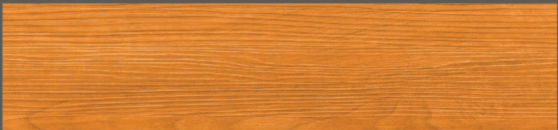
TV 3006 Real Cherry