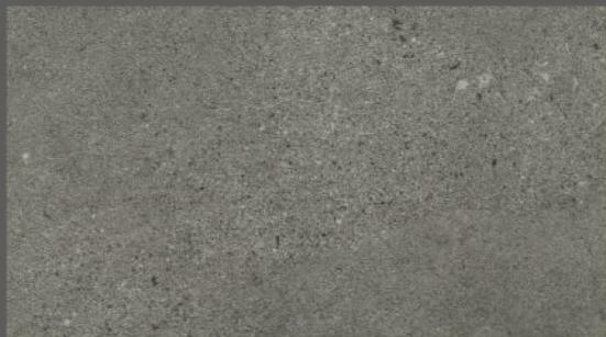
TV 3026 Stone