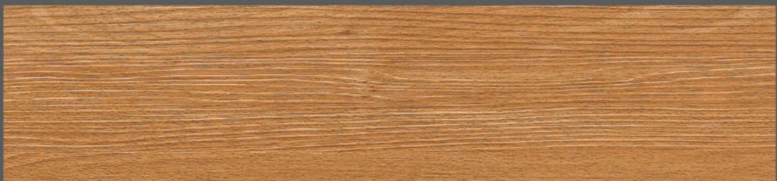
TV 3014 Natural Beech