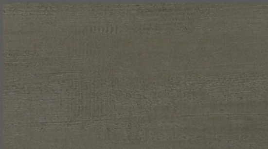
TV 3033 Gray Sand NEW