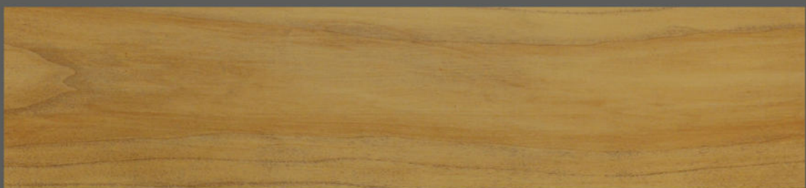
TV 3030 Butternut Teak NEW