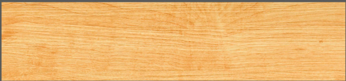
TV 3010 Warm Cherry