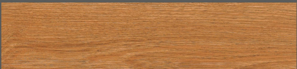
TV 3004 Parma Oak