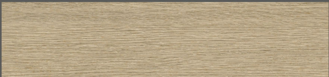
TV 3003 Washed Oak