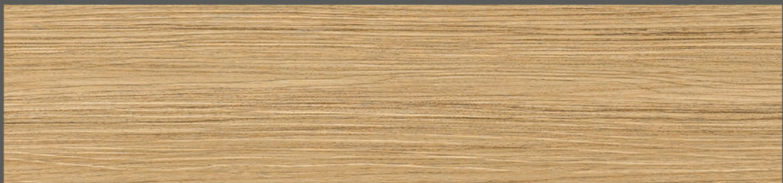
TV 3015 Vicenza Elm