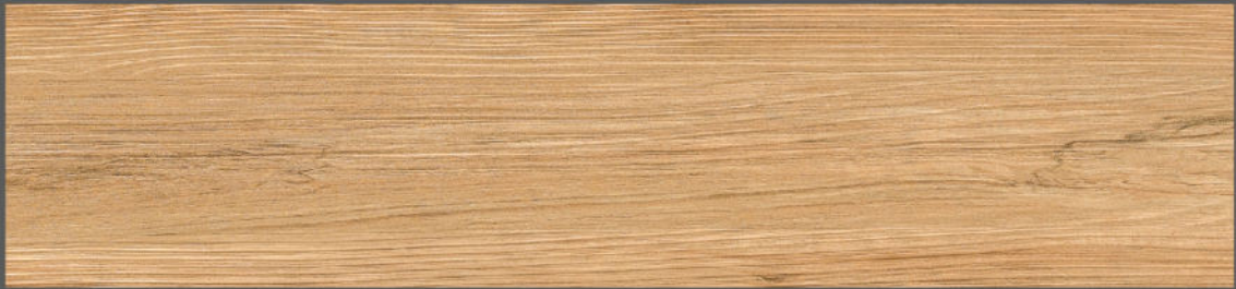
TV 3008 Sand Malmo