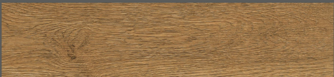
TV 3005 Vintage Oak