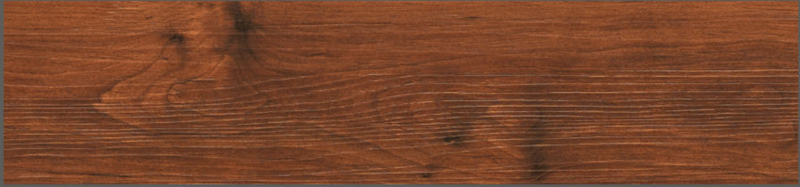
TV 3017 Original Cherry

Size 152.4mm x 914.4mm 24 pieces/box 3.34sqm