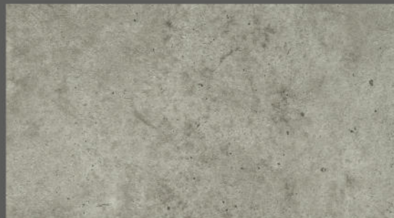
TV 3024 Grey Slate