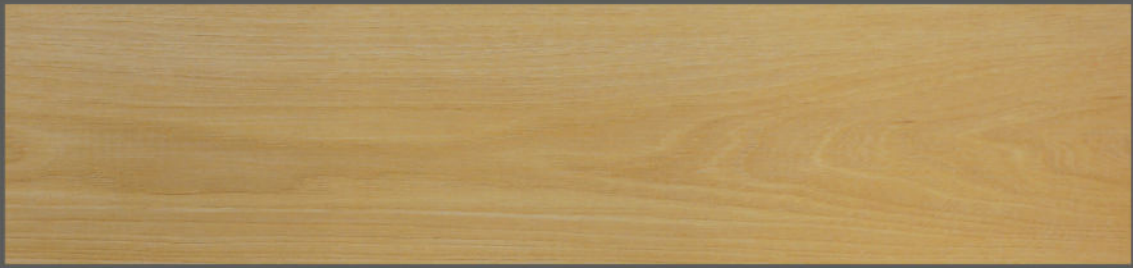
TV 3029 Summer Teak NEW

Size 152.4mm x 914.4mm 24 pieces/box 3.34sqm