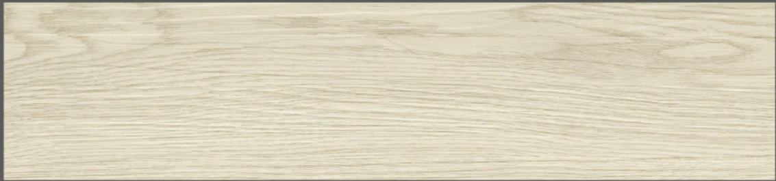
TV 3013 White Oak