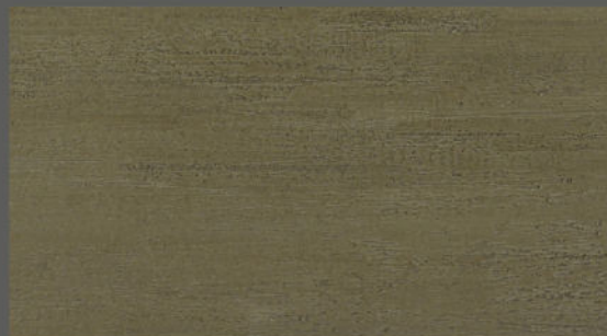
TV 3032 Natural Sand NEW

Size 304.8mm x 609.6mm 18 pieces/box 3.34sqm