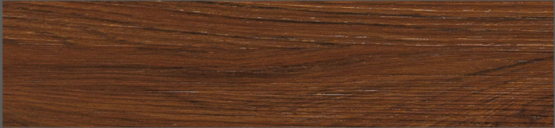
TV 3007 Merbau Wood