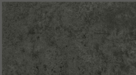
TV 3025 Dark Grey Slate