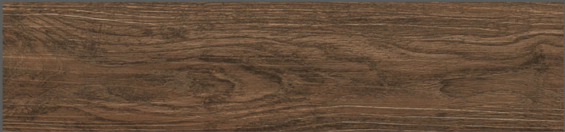
TV 3001 Rustic Oak